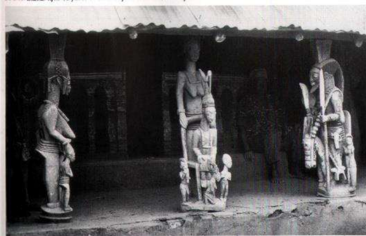
Figure 4: Caryatids at the end of a court hall