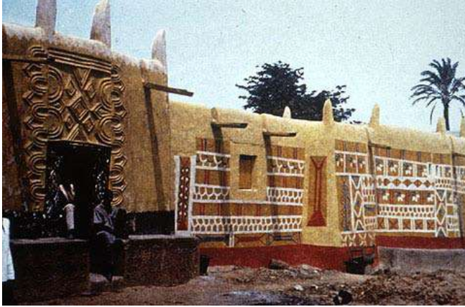
Figure 3: Decorated house facade in Zaria, Nigeria: painted facade and mud relief.

well as customs, religious and cultural belief and also taboos (Agboola and Zango, 2014). Areas where art featured in African traditional buildings include exterior and internal walls, posts, beams, lintels, ceiling boards, furnishings, furniture, decorations and artifacts used in domestic activities including traditional altars located within the houses (see figures 3 and 4). Africa's architecture was known to be supported by elaborately carved wooden posts often depicting the human body (see figure 4).