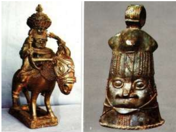
Figure 1b: Equestrian figure and Bronze bell of human face, Benin, Edo State