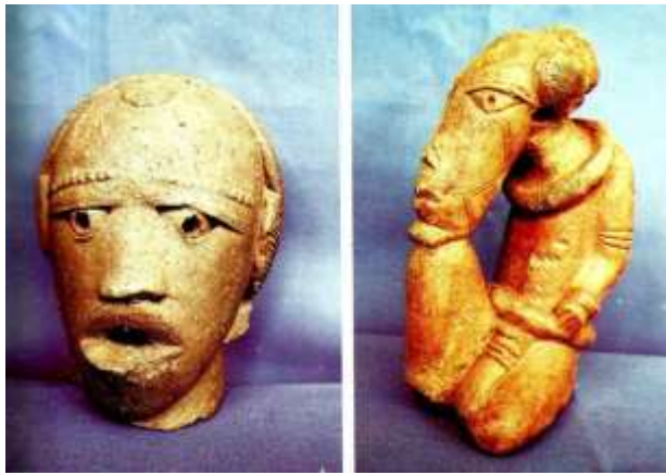
Figure 1a: NOK Terracotta Human Head and Kneeling figure, Kaduna State Source: NCMM (2009) ALL IS NO LOT: A national treasure worth preserving

historical perspective to the African art but in a slow progression. Today, many museums all over the world are enriched with art works of African origin. Among the earliest surviving examples of African art are images which were painted on rock slabs found in caves in Namibia. Other examples of early African arts include the terra-cotta sculptures by the Nok artists in northern Nigeria between 500 BC and 200 AD (see figure 1a), the Nok terracotta human head and kneeling figure (See Figure 1b), equestrian figure and bronze bell of human face, Benin (See Figure 1c), terracotta woman figure and bronze head of an Oni of Ife, Osun State (NCMM, 2009).