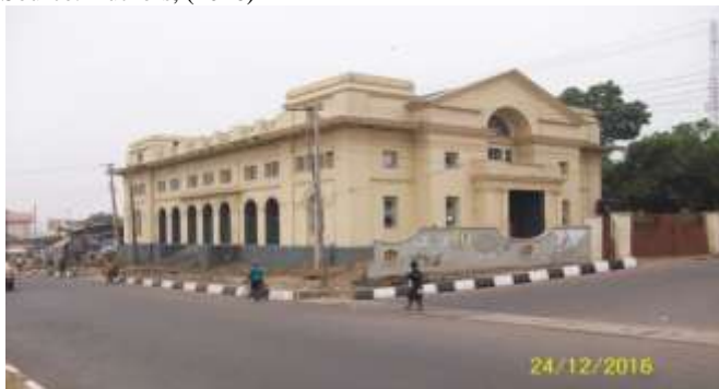
Figure 6b: Pictorial view of the Centenary Hall Ake, Abeokuta-Nigeria built in 1930 (The building typifies the obliteration of traditional architectural styles by European influence).