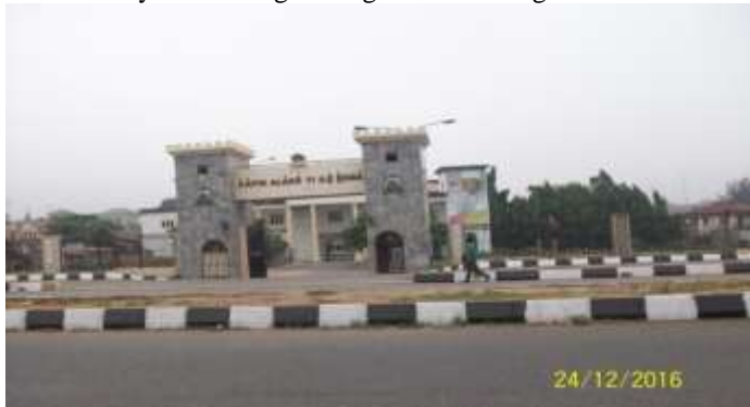
Figure 5: Gate view of the Alake Palace Ake, Abeokuta-Nigeria (Elements of European, Yoruba and Jewish motifs combined to produce new hybrid aesthetics).

While the Western worlds were attempting to help Africans to be more religious and as well advance in technology, they were not careful enough to guard and guide some of the African arts jealously especially those that were not fetish. Since then, many smaller communities have lost their identity.