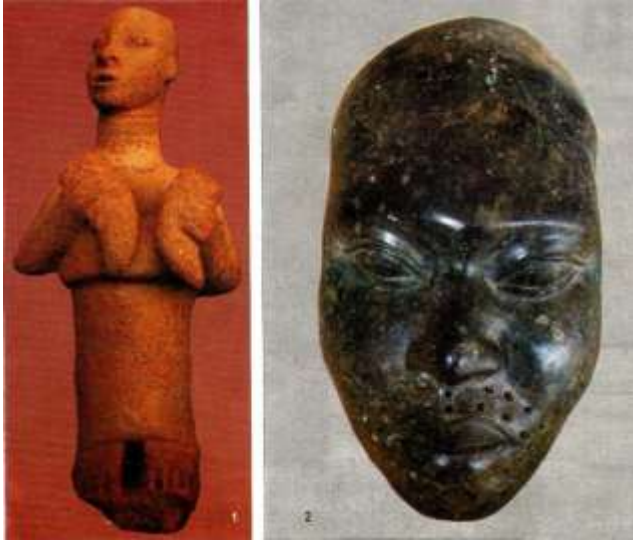
Figure 1c: terracotta woman figure and bronze head of an oni, ife osun state

The case of African architecture, on the other hand like other aspects of the culture in Africa, is exceptionally diverse. Many ethno-linguistic groups throughout the history of Africa have had their own architectural traditions. The architecture of Africa has been subjected to numerous external impacts from the earliest periods for which evidence is available (Tetteh, 2010). The history of African art and architecture spans a vast period of time, beginning as early as 25,500 BC and continuing to the present. Traditional architecture has been seen as the house building styles of indigenous people (Okeyinka and Odetoye, 2015) and factors such as social, economic and climatic influences of such architecture. They further argued that culture is the most important of these factors since it enables what is acceptable to the community. Emphasizing that in traditional architecture, the decisions involved in the activity of building are pre-determined by the tradition and the customs of the people.