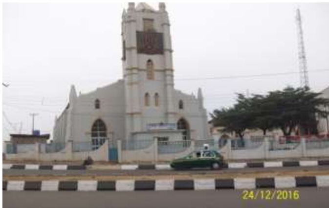
Figure 6a: Pictorial view of the Cathedral Church of Saint Peters Ake, Abeokuta (The first Church in Nigeria) (This architecture was built in the style of Brazilian cathedrals. A great influence of the Afro-Brazilian style)